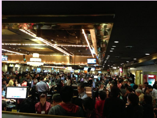
A view of the 'main floor' at Normandie